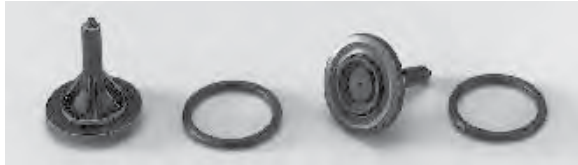
1" and 1½" Poppet Kit