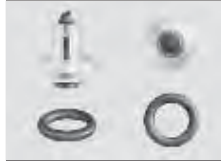
½" and ¾" Poppet Kit

The standard elastomers for the poppet valves and O-rings are EPT/EPDM, and Viton®/Fluoroelastomer. These elastomers have historically been able to handle the vast majority of the applications in which we've been involved. However, Butyl, Hydrin, Kel-F®, Silicone and Nitrile can be supplied for chemicals requiring such materials.