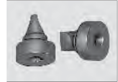
½" and ¾" Bellows Kit

Duckbill valves are required in those applications where heavy slurries or fibrous materials are being pumped. Heavy slurries should be flushed from the bellows before the pump is shut down. The standard elastomers are EPT/EPDM and Viton®/Fluoroelastomer. However, Butyl, Hydrin, Kel-F®, Silicone and Nitrile can be supplied.