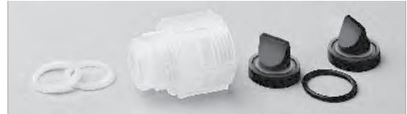
1" and 1½" Bellows Kit

(Valve extension required only on suction port.)