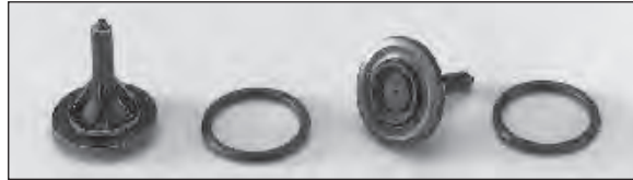
1" and 1 1/2" Poppet Kit