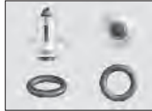
1/2" and 3/4" Poppet Kit

The standard elastomers for the poppet valves and O-rings are EPT/EPDM, and Viton®/Fluoroelastomer. These elastomers have historically been able to handle the vast majority of the applications in which we've been involved. However, Butyl, Hydrin, Kel-F®, Silicone and Nitrile can be supplied for chemicals requiring such materials.