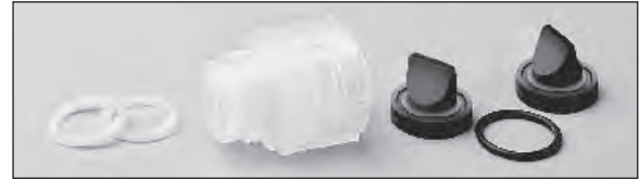
1" and 1 1/2" Bellows Kit

(Valve extension required only on suction port.)