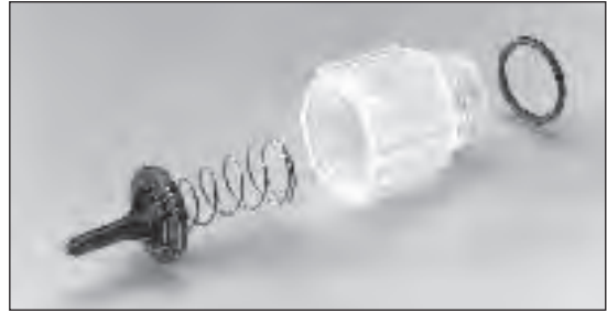
(Valve extension required only on suction port.)

Anti-siphon springs are available to springload poppet valves. Use of these springs produces more positive shutoff of poppet valves and permits use of the pump where there is a positive pressure on the suction side. Available for the 1", 1½", and 2" models. To order, select the proper spring material and O-ring by referring to the Chemical Resistance Section. The appropriate kit can then be chosen based on the blow-off pressure (PSI) required.