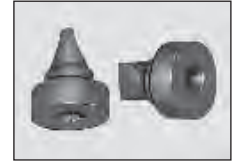
1/2" and 3/4" Bellows Kit

Duckbill valves are required in those applications where heavy slurries or fibrous materials are being pumped. Heavy slurries should be flushed from the bellows before the pump is shut down. The standard elastomers are EPT/EPDM and Viton®/Fluoroelastomer. However, Butyl, Hydrin, Kel-F®, Silicone and Nitrile can be supplied.